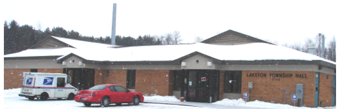
The meeting hall area

was also enlarged to better serve the community. It received updated lighting & sound equipment so that the public can address the board with questions and concerns. The entire audience will be able to hear each other's comments as well as the answers from board members. The new system also allows the hearing impaired to participate.