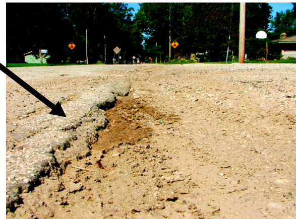
Example of bad drainage with road edge crumbling