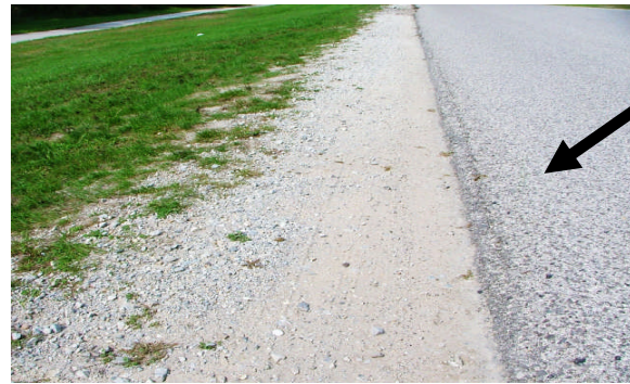
Example of good drainage with road edge in good condition

It is important to remember that homeowners along the roadway need to maintain the drainage swales/ditches at the road side. Water drainage away from the road and keeping the road's gravel base dry is the secret to maintaining the road in the best condition possible for as long as possible. In our area, we average around 40 freeze and thaw cycles each winter season. Water under the paved surface is not a good thing and results in the road surface deteriorating prematurely. Please do not fill in these drainage ditches. Below are examples of good drainage vs bad drainage.