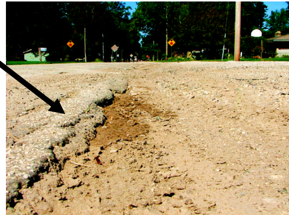
Example of bad drainage with road edge crumbling