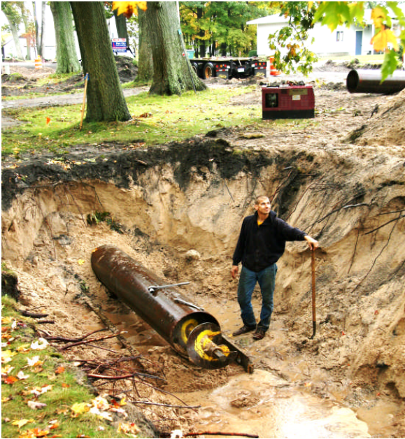
To the left is a photo of the "jack and bore" process used to save as many trees as possible within the construction route.

When the construction is complete, Laketon Township will be looking into a tree replacement program to restore the scenic route. Total cost is in excess of $50,000.